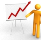
Your Bottom Line

We provide a host of engineering and system integration services and have skilled and knowledgeable personnel with in depth domain experience and technical proficiency. This is coupled with the use of proven methodologies to help deploy solutions on-time and within budget.